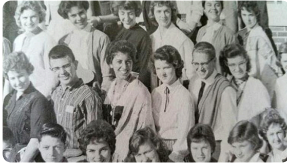
Manatee High School